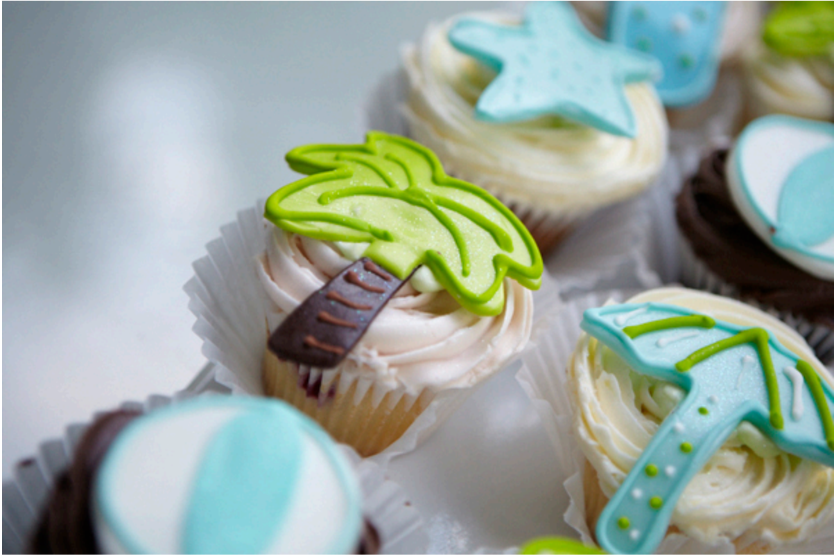
Delightfully decorative, and divinely delicious edibles by Eat My Words .